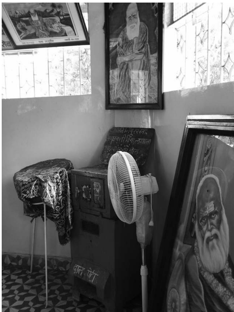
Figure 7 Portraits of Tāj al-dīn Bābā.